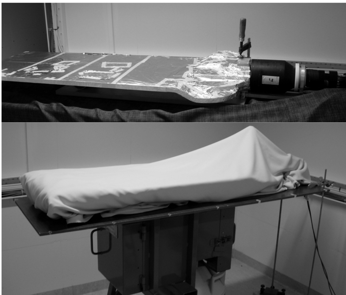
Fig. 10: The anti-coincidence shield. Top) The scintillator plate and light guides covered in aluminium foil, and the PMT. Bottom) The anti-coincidence shield placed above the germanium detector. The shield is covered in cloth to prevent ambient lighting from reaching the PMT