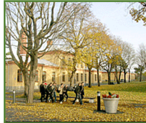
Nordita, Stockholm, Sweden