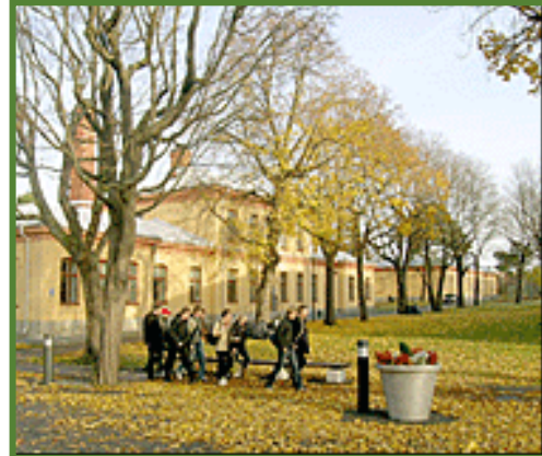
Nordita, Stockholm, Sweden